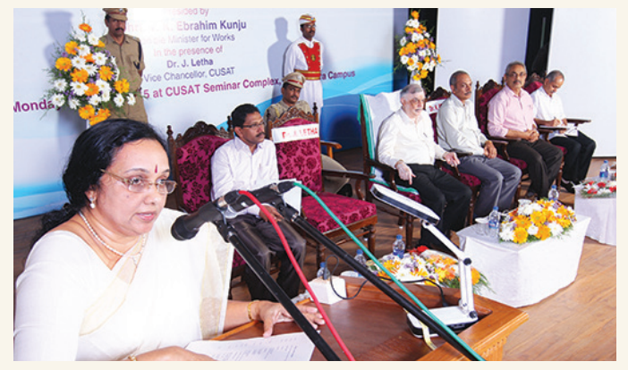
Address by the Vice Chancellor