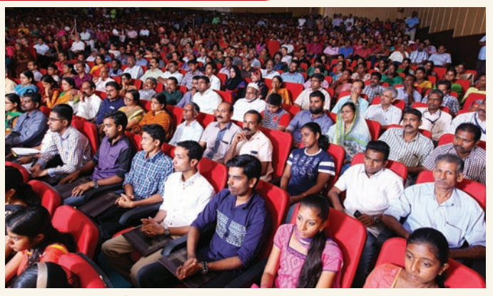
An attentive audience