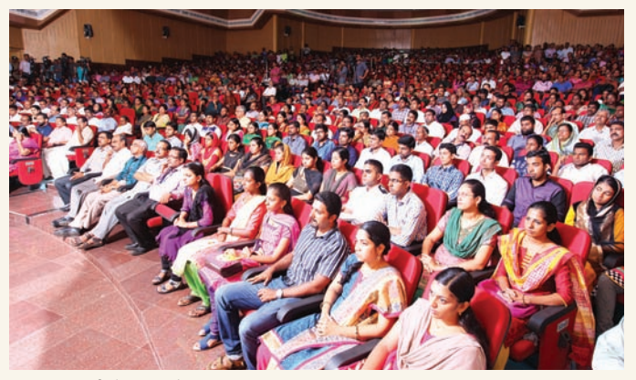
A view of the audience