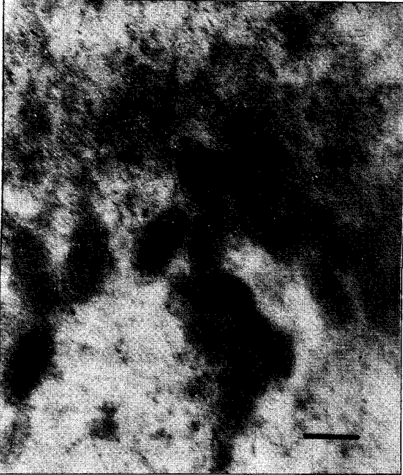
Fig. 1. Complete viral particles in the gill nucleus. Note the oblong-shaped, rounded and segmented appearance of the capsids (stained with uranyl acetate and lead citrate). Scale bar = 100 nm.