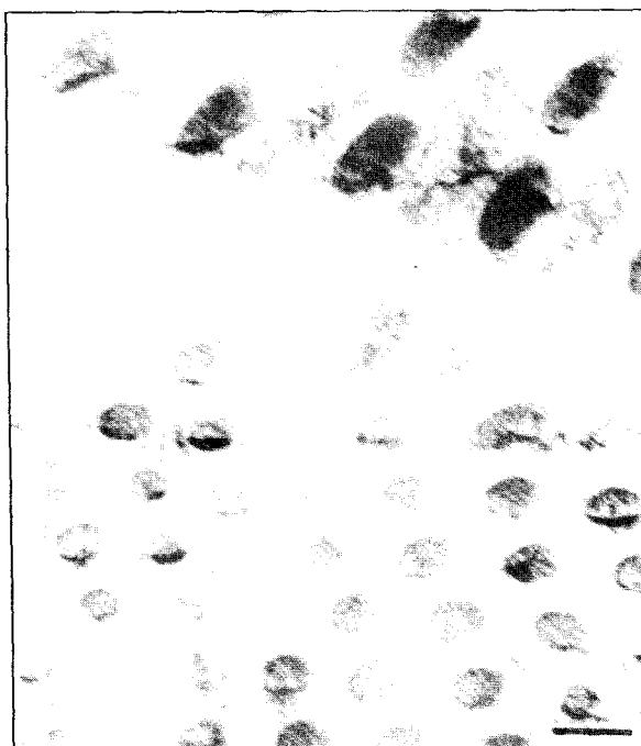
Fig. 3. Higher magnification of paracrystalline array of the viral particles showing both empty and full viruses. Scale bar = 100 nm.