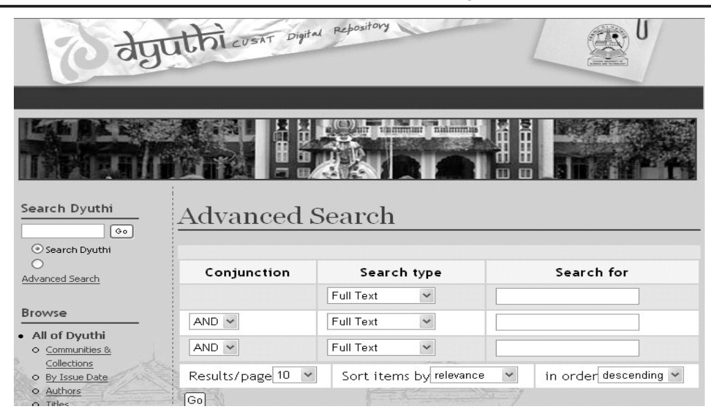
Advanced Search options of CUSAT ETD