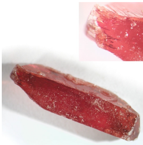
Fig. 1. Single crystal of guanidinium \text{Co}^{\text{II}} sulphate hexahydrates (longest dimension 1.4 cm). Small detail: the crystals easily undergo plastic deformation and are therefore (unfortunately) unsuited for cutting or polishing.

stress. Thus, it is impossible to cut or polish the crystals to produce samples for optical or mechanical measurements. A photograph of one single crystal of \text{GuCoS} is shown in Fig. 1; a detailed view of one corner shows the deformation caused by removing another, only slightly intergrown crystal.